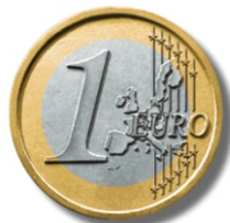
comparison to 1 Euro coin